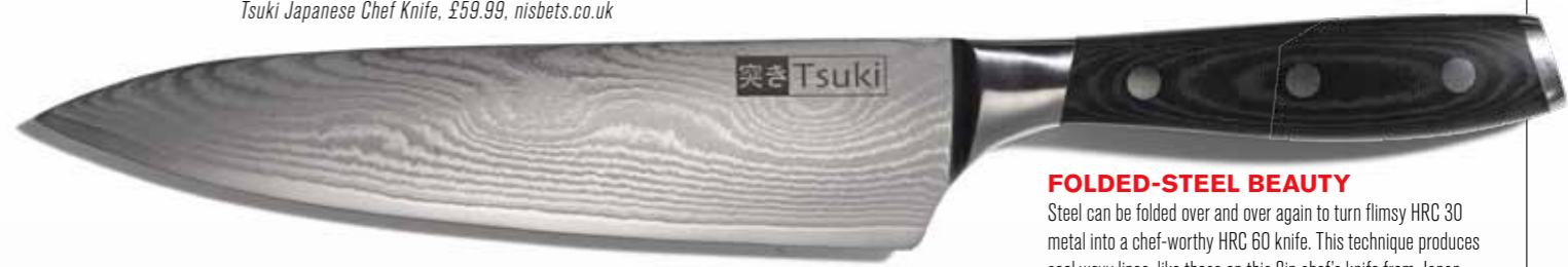
Tsuki Japanese Chef Knife, £59.99, nisbets.co.uk

YOU SHOULDN'T grip the handle like a broadsword; you're not a knight, and you'll lose control of your blade.