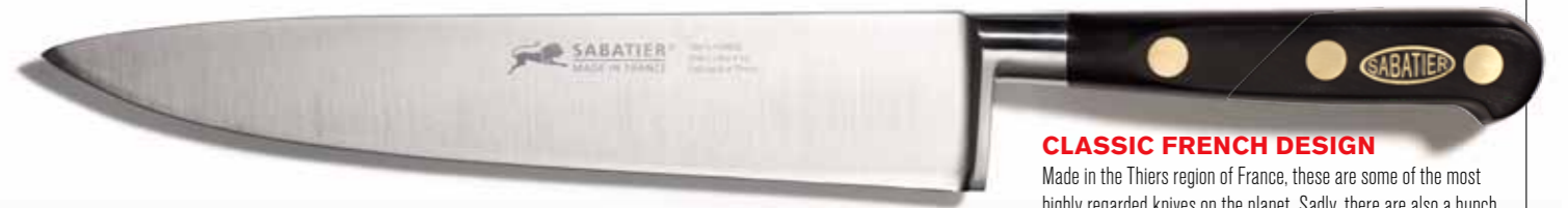
Lion Sabatier Idéal Cook's Knife, £62.95, kitchenkapers.com

Steel can be folded over and over again to turn flimsy HRC 30 metal into a chef-worthy HRC 60 knife. This technique produces cool wavy lines, like those on this 8in chef's knife from Japan.