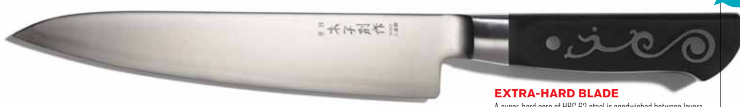
I.O. Shen Chef's Knife, £84.95, ioshen.co.uk

Family-owned Japanese knife maker Global first hit the UK market 25-odd years ago. Now instantly recognisable, their handcrafted knives can be found in the hands of Michel Roux Jr, among others.