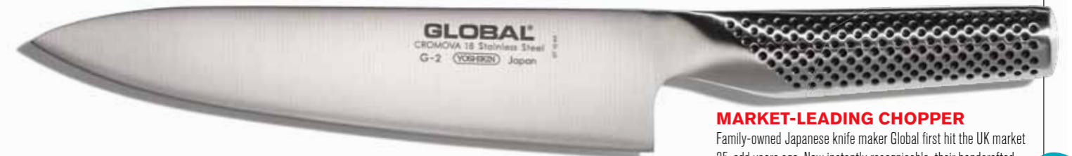
G-2 Global Cook's Knife, £89.99, nisbets.co.uk

Made in the Thiers region of France, these are some of the most highly regarded knives on the planet. Sadly, there are also a bunch of cheapo imitations bearing the Sabatier name. Beware.