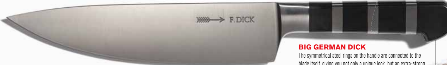
Dick 1905 Chef's Knife, £82.79, nisbets.co.uk

A super-hard core of HRC 62 steel is sandwiched between layers of much softer HRC 10, which act like a shock absorber, giving you a razor-sharp cutting edge that won't crack under pressure.